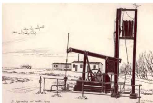
One of the Formby oil-wells; "nodding donkeys" 1949

boulder clay affecting the health of vegetation. Satellite image analysis suggests a number of previously unsuspected locations of subsurface oil accumulation in the Formby area not explored by drilling in the late 1930s. Whereas the big oil companies are unlikely to be interested in the amounts involved, valued at only a few million pounds, the newly identified locations, roughly south east of Woodvale aerodrome, may represent oil deposits ripe for exploitation. Following his talk, Dr Worden estimated that exploratory drilling would cost only a few thousand pounds for each location investigated and that the returns could be substantial. Oil from the Formby oilfield is 'clean' with low sulphur content and little need for refining