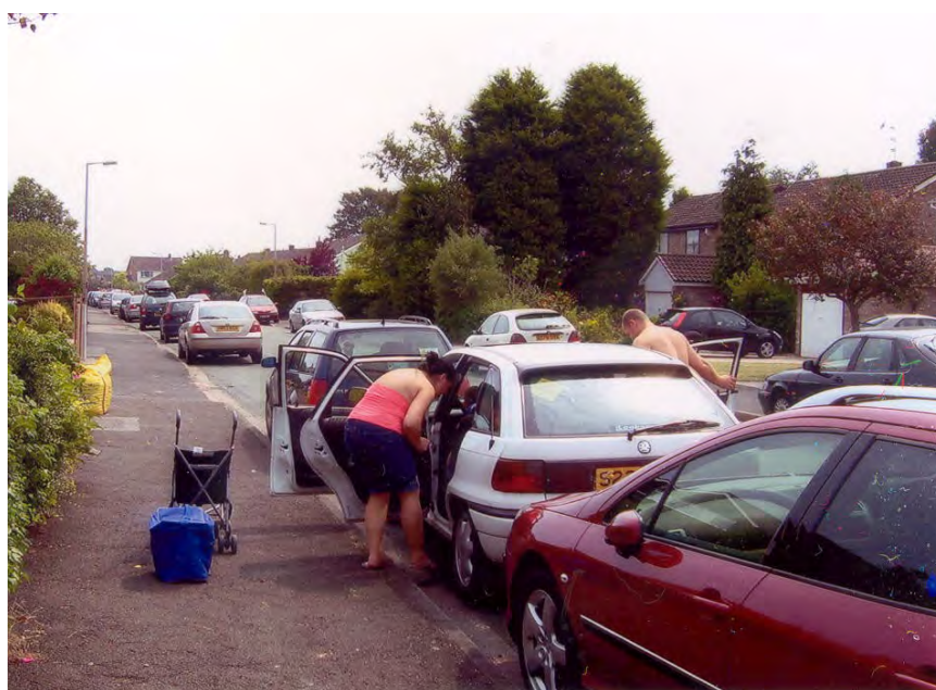
(Left) Increasing irritation! The volume of traffic aiming for Victoria Road is becoming an increasing problem for local residents. This is a typical weekend sight in the 'over-spill' Harrington Road.

A residents group is to be set up to provide local feed-back and help in other ways to tackle the problems