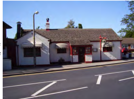
The Old School which gives 'School Lane' its name is just one of the old Formby buildings to be looked at during this special meeting.

“A New look at Formby’s Old Cottages” is to be the subject of a meeting of the History Group to be held next January. For this special occasion we will arrange a display of the unique collection of thirty or more ceramic model cottages made by Mr A. Reeves and presented to the Society some 25 years ago. Some of these have been exhibited in the Society Museum in Duke Street Library in the past. All are accurate scale models of the original buildings some of which have subsequently been demolished. Others survive as Grade 2 Listed Buildings but this has not always prevented changes, sometimes quite extreme. We are in the process of updating our records and this promises to be an interesting exercise.