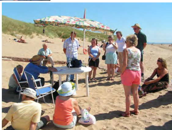
Right; The Formby Lifeboat Station Visit Sunday 16th July