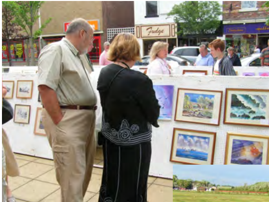
Left, The Open Air Art Exhibition, Chapel Lane.