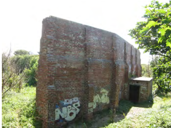
(left), Rifle Range, (WW2 (Kings L.pool Regiment), The King's main depot was here in Formby at Harington Barracks throughout the second World War. Rifle practice took place on this open range , later at Altcar Rifle Range, This is our only surviving structural reminder of the King's Liverpool Regiment.