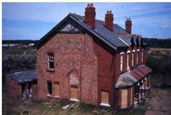
(Left), 'The Briars', Albert Rd, 1976. Liverpool Catholic Girls Orphanage. (Convent of Notre Dame, Mount Pleasant). It looks just like any pair of Victorian semi-detached houses and in 1973 this photo shows nothing to signify it as a convent. The Army had used it.