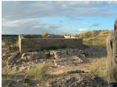
(Above, left), The remains of a WW2 ROC Observation Post on the dunes south of the Promenade . (Right); ROC Nuclear Monitoring Post built during the 'Cold War' in 1962.