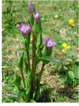
Field Gentian (see p7)