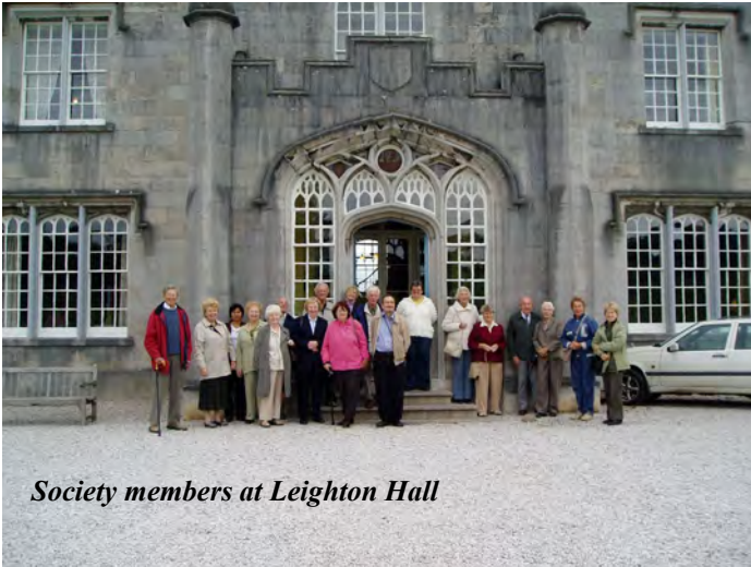
Society members at Leighton Hall

The weather was set for a good day as 25 members and friends boarded the coach at Cross Green for an 8-30 start on 20th September. To avoid delays in Preston we took a cross country route to the M6 and headed north to our first stop at Carnforth railway station and museum. Much of David Lean's classic film Brief Encounter was made here in 1945 and the waiting room has been refurbished as it was at this time. The museum showed many interesting exhibits of Carnforth and its railway history from that period giving us a dramatic time shift as we stepped out onto the platform to see the Intercity 125 trains rushing through.