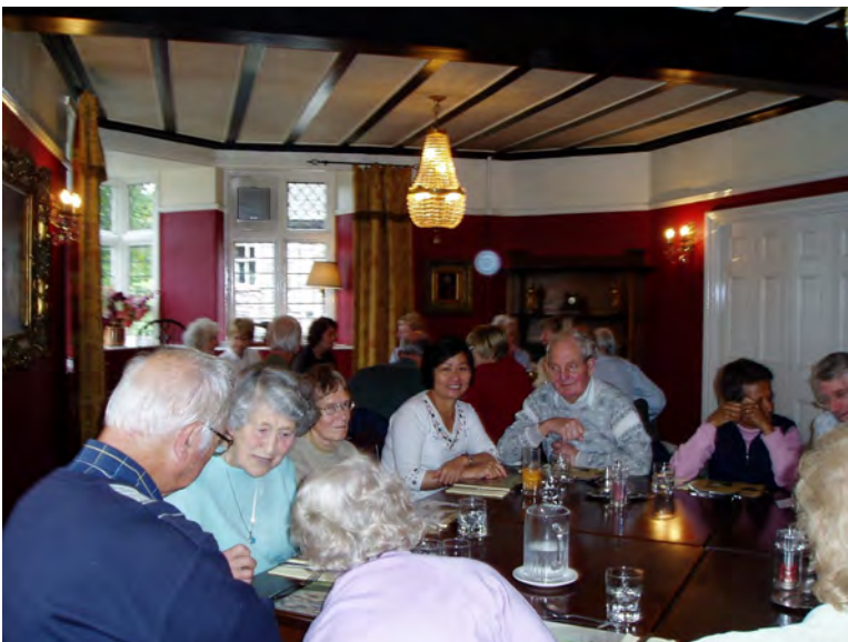
Above; Outside the Wheatsheaf, Beetham.

Our journey home was delayed for a few minutes by the breakdown of a large blue lorry right on the exit roundabout of the M6 slip road but we arrived back around 6-45 pm after an enjoyable day. Unfortunately our numbers were lower than normal possibly because the visit took place after the end of the school holidays and many people were away. In future we should probably arrange our event a few weeks earlier as we did in 2006 to make it more convenient for our members. Please let us know what you think about this