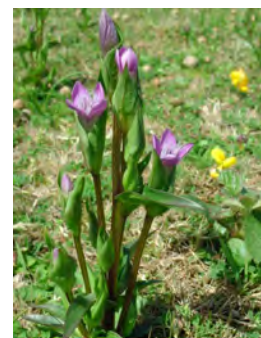
Field Gentian (see p7)