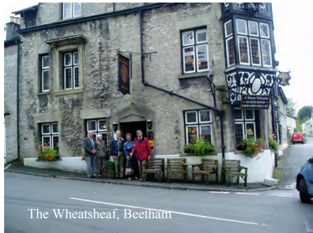
The Wheatsheaf, Beetham

The Wheatsheaf Hotel provided us with what they described as a light two course lunch in a delightful upstairs private room before we headed off to nearby Leighton Hall.